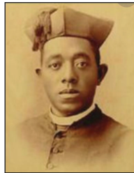
Venerable Augustus Tolton

Last year, CCW-ADW supported the Tolton Ambassadors-DC to promote the cause for Sainthood of the first acknowledged black priest in the US. https://sites.google.com/view/toltonambassadorsdc/home