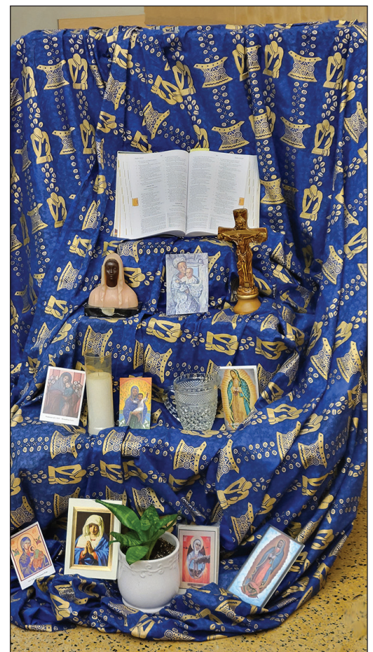
Enthronement of the Bible