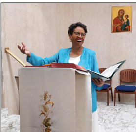
Glorious music at Mass