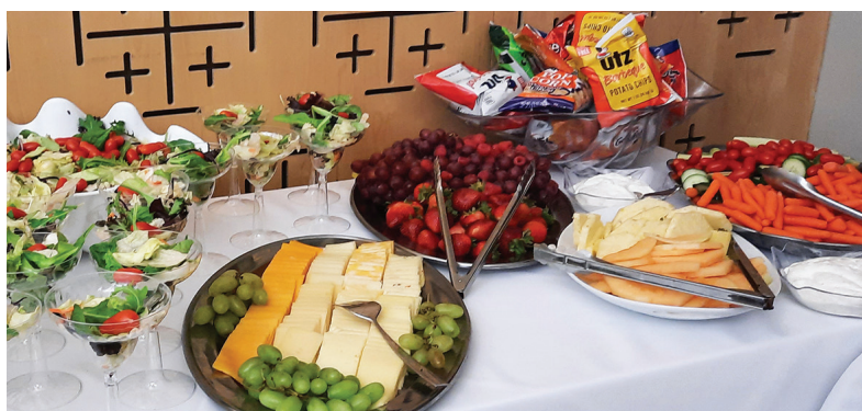
Feast your eyes!